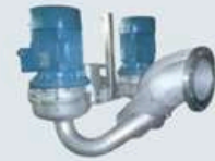
The only patented system to lift effluent directly at the point of entry

The DIP System® provides innovative, durable and economical pumping stations.